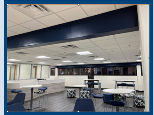
-Photo of the Student Accounts area after the remodel.