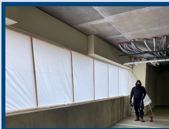
-Photo of OFM staff member and the enclosed area at the HOP.

Housing Maintenance Staff worked to winterize the parking garages at the Heights on Pecan (HOP) apartments as freezing temperatures approached DFW. The hard work paid off! The HOP didn't experience any freeze issues.