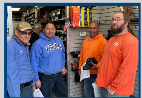
-Photos of a few OFM Staff selecting safety work boots or shoes.